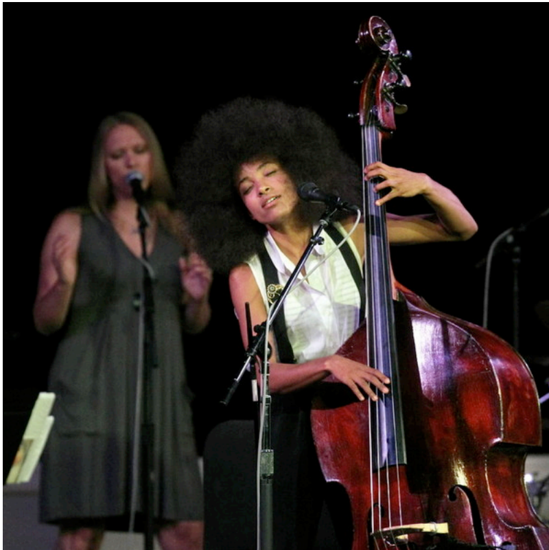
Esperanza Spalding performs at Symphony Center Friday.