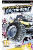
MotorStorm: Arctic Edge