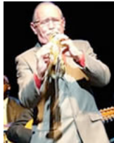
Buena Vista Social Club