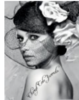
Music charts coming soon