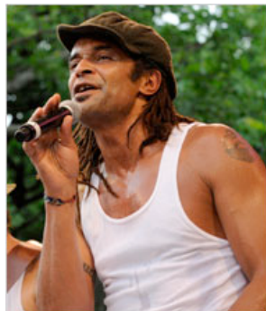
Yannick Noah at Central Park SummerStage on Sunday.

Yannick Noah, a French tennis champion in the 1980s and '90s, is now well into a second career as a singer. On Sunday afternoon he headlined a Central Park SummerStage concert supported by the French Embassy to coincide with the Fête de la Musique, a nationwide day of free concerts in France. Among the athletic elite with pop ambitions, Mr. Noah, 49, is more convincing than, say, Shaquille O'Neal as a rapper.