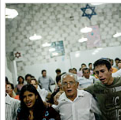
Reaffirming Faith, Leaving Peru for Israel