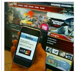
Investors Bet on Payments via Cellphone