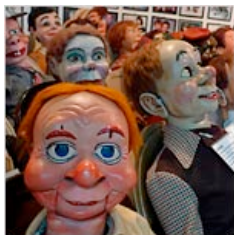
Bright Lights, Wide Eyes