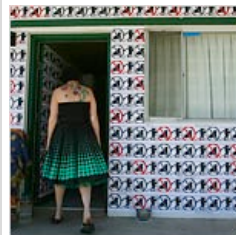
In Reno, Art Canvases That Include Shag Carpet